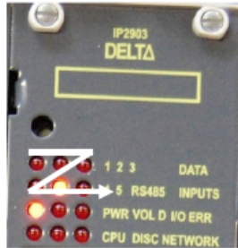
FIGURE 50 – DELTA LED STARTUP PROCESS

The reader has finished the booting process when the “PWR” LED is maintains a solid red state and the “CPU” LED (both located on the Delta Module – diagram #4) blinks at a constant rate. At this point, all of the vital processes of the Elite Reader have started and the reader can now be accessed VIA LAN/Ethernet.